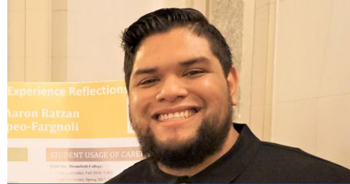
Passionate About Research

Monmouth University seniors recognize superior teaching.