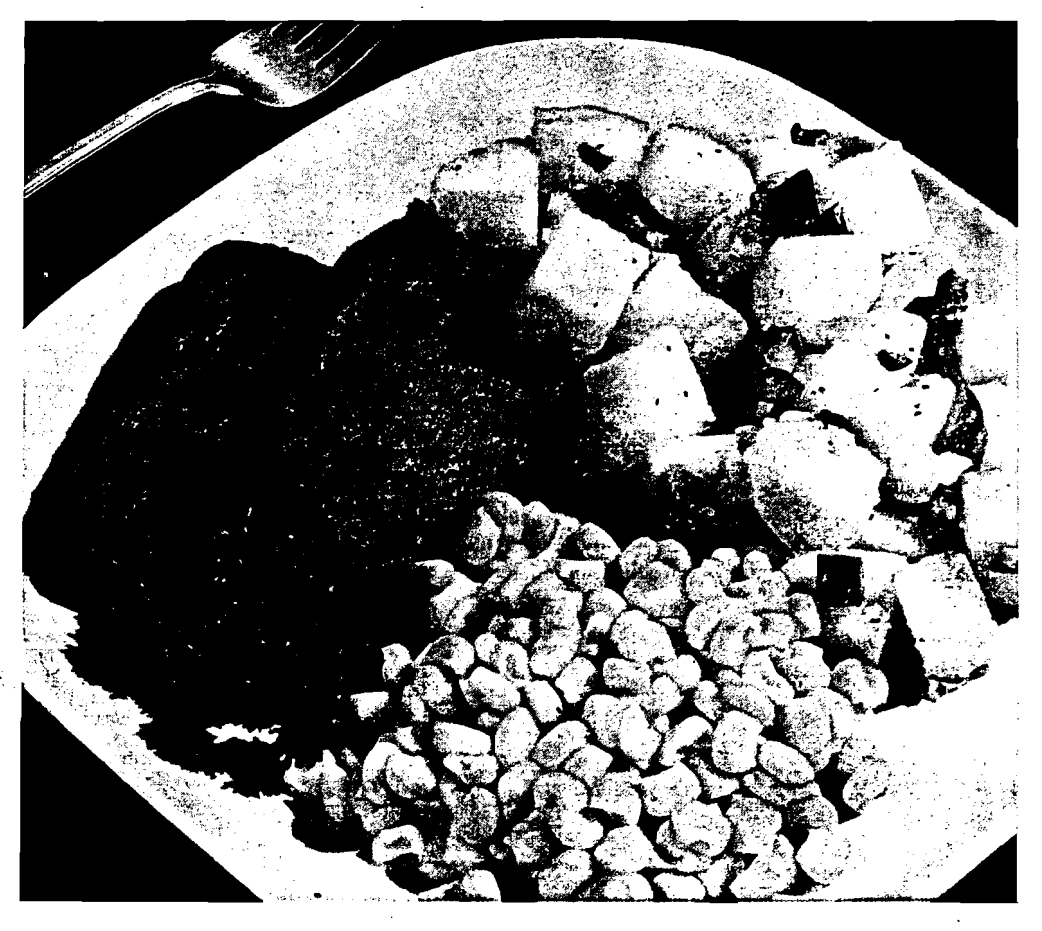
Niblets whole kernel Corn