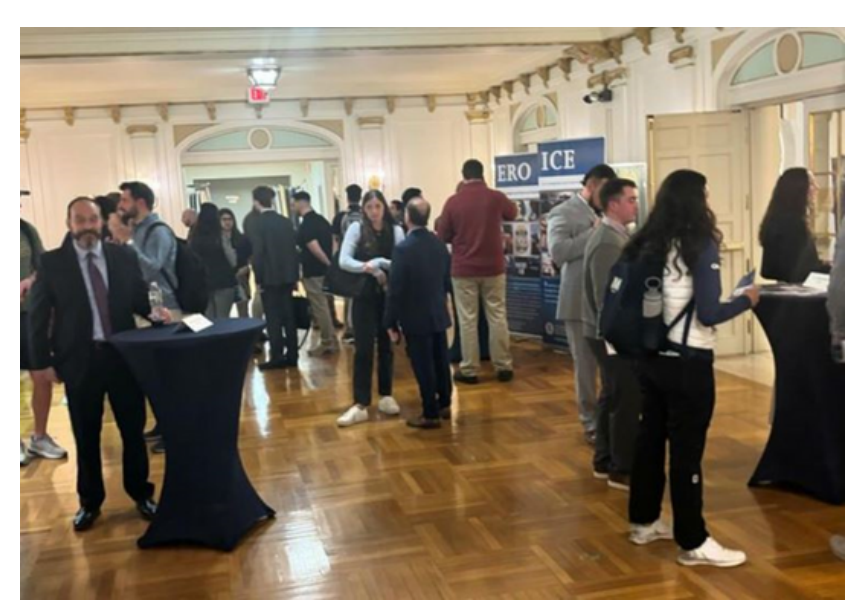
STUDENTS NETWORK WITH PRACTITIONERS FROM MANY FEDERAL AGENCIES

On April 4, 2024, the Department of Criminal Justice hosted its annual Federal Law Enforcement Career Day for undergraduate and graduate students interested in a career with a federal law enforcement agency. This event featured representatives from numerous federal agencies and was attended by many students from several different academic departments on campus. We are proud to note that several of the practitioners who presented at this event are Department alumni who initially made contact with their future employer at an event like this.