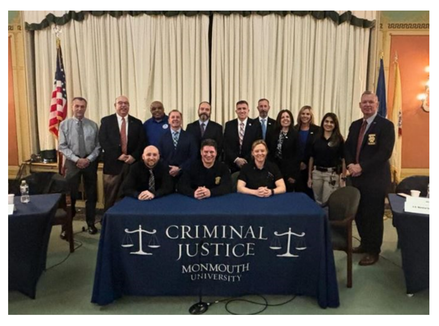
FACULTY AND FEDERAL LAW ENFORCEMENT PRACTITIONERS

On April 4, 2024, the Department of Criminal Justice hosted its annual Federal Law Enforcement Career Day for undergraduate and graduate students interested in a career with a federal law enforcement agency. This event featured representatives from numerous federal agencies and was attended by many students from several different academic departments on campus. We are proud to note that several of the practitioners who presented at this event are Department alumni who initially made contact with their future employer at an event like this.